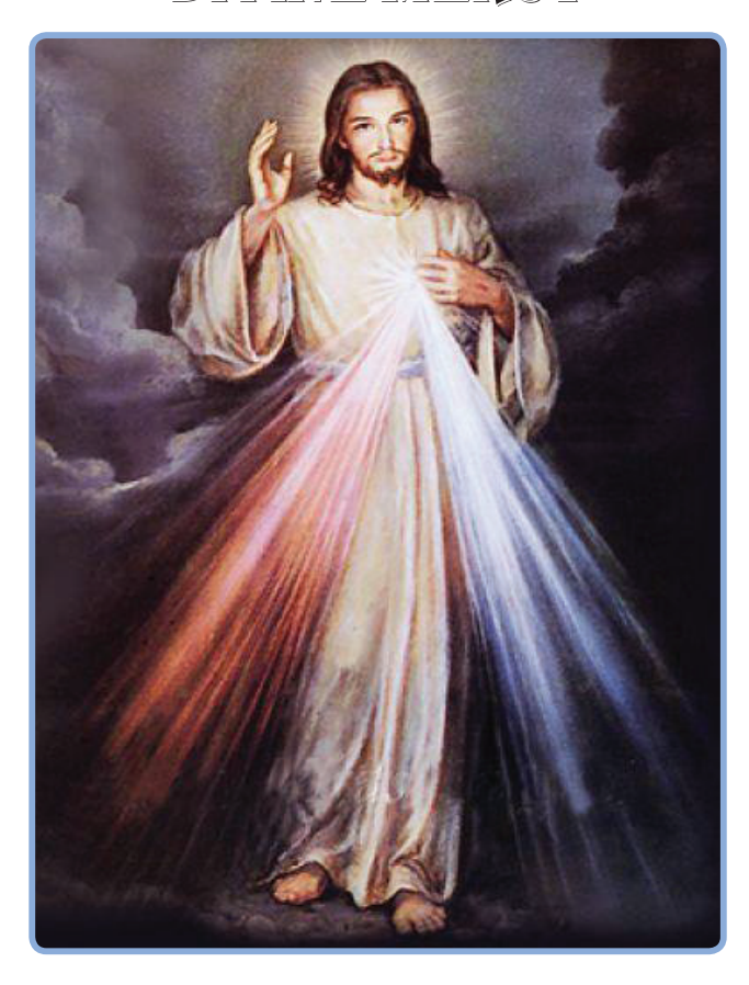
Jesus I Trust In You! "On the cross, the fountain of My mercy was opened wide by a lance for all souls-no one have I excluded!" (Diary 1182)

"...certain souls' salvation depends on your prayers at their final moment." Jesus to St. Faustina, diary 1777