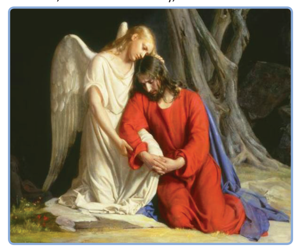
With trust and love, let us pray:

Statistics say that every five minutes someone in the world commits suicide. This reveals great suffering and sorrow in the human heart, the loss of hope and no desire to live. How many of our brothers and sisters are living in despair and crying out for help. Through prayer, we can help them. And God, in his infinite mercy, can save them.